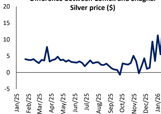
Difference between Comex and Shanghai Silver price ($)