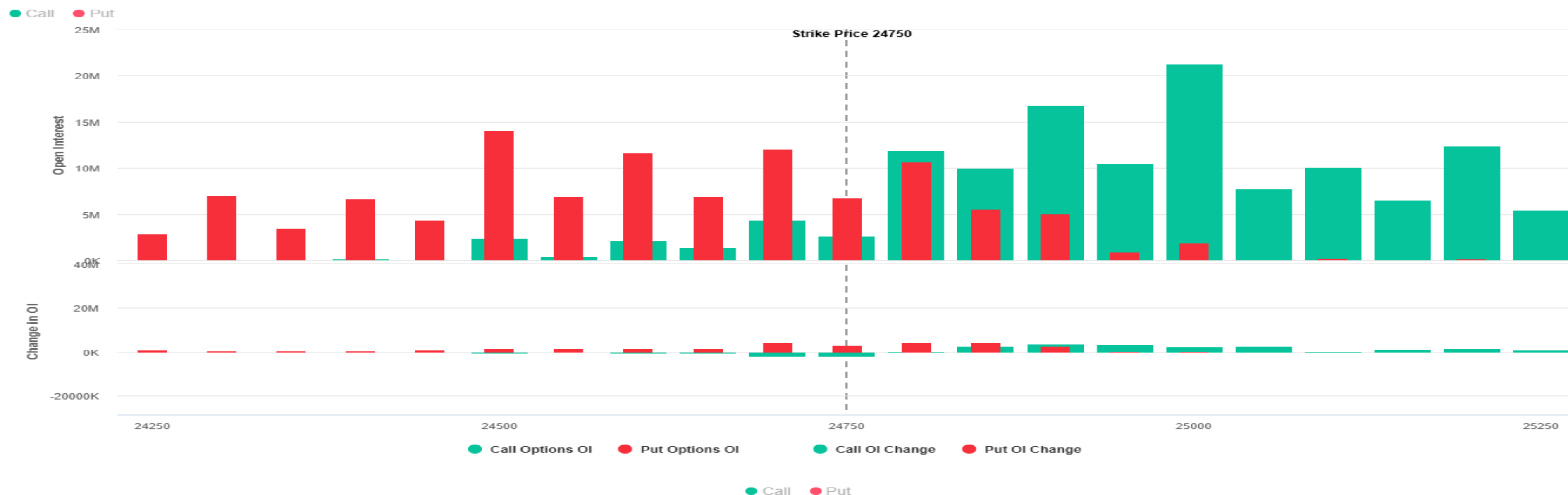
Nifty 50 OI Chart(09 Sep 2025)

Investment in securities market are subject to market risks, read all the related documents carefully before investing.