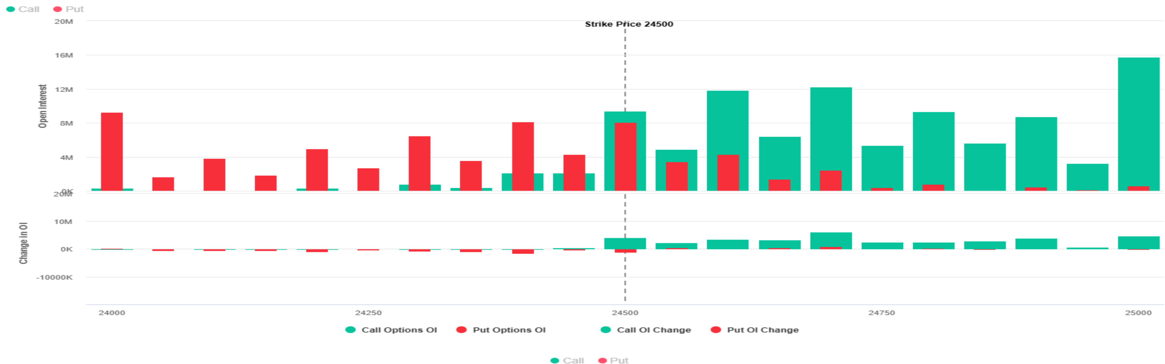
Nifty 50 OI Chart(14 Aug 2025)

Investment in securities market are subject to market risks, read all the related documents carefully before investing.