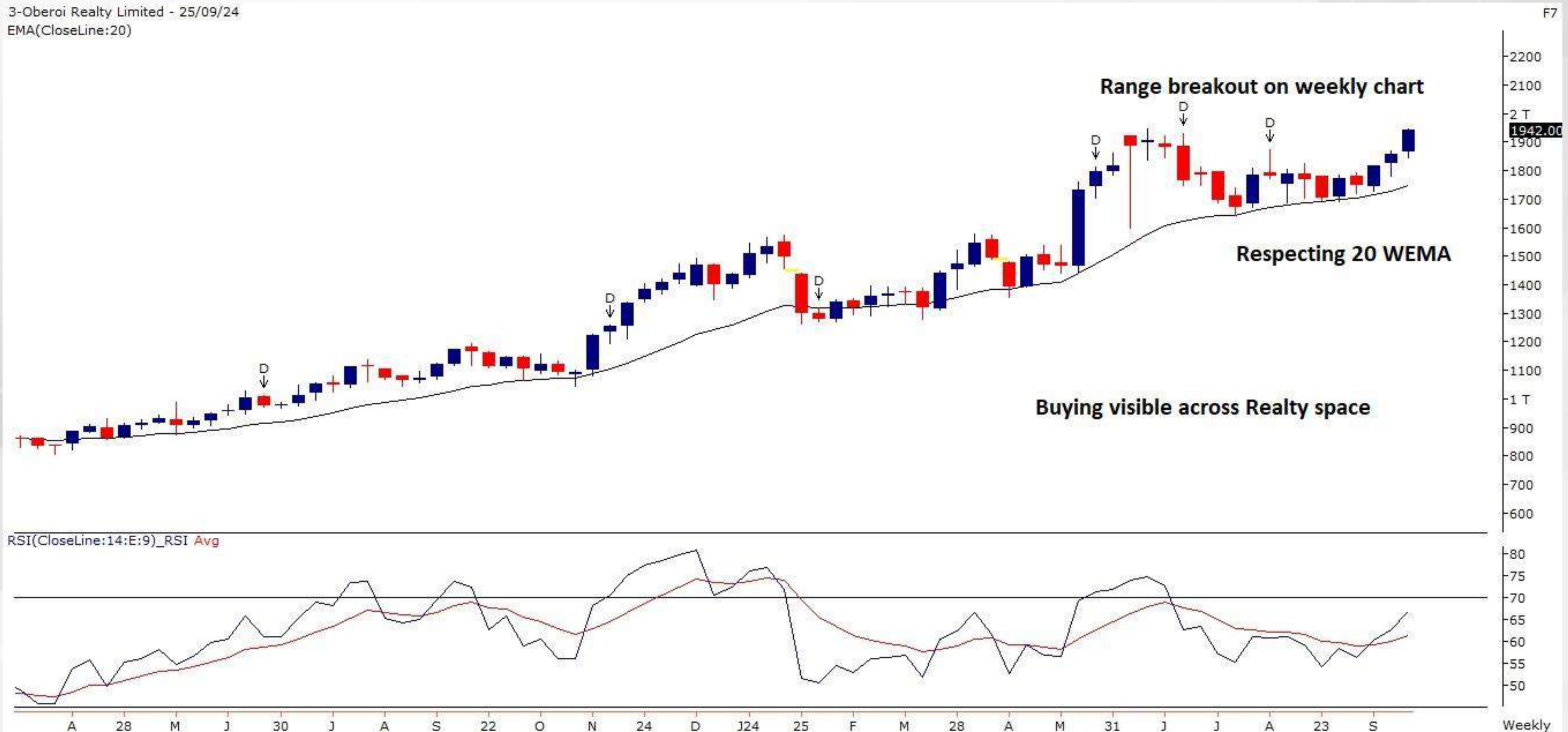
3-Oberoi Realty Limited - 25/09/24 EMA(CloseLine:20)