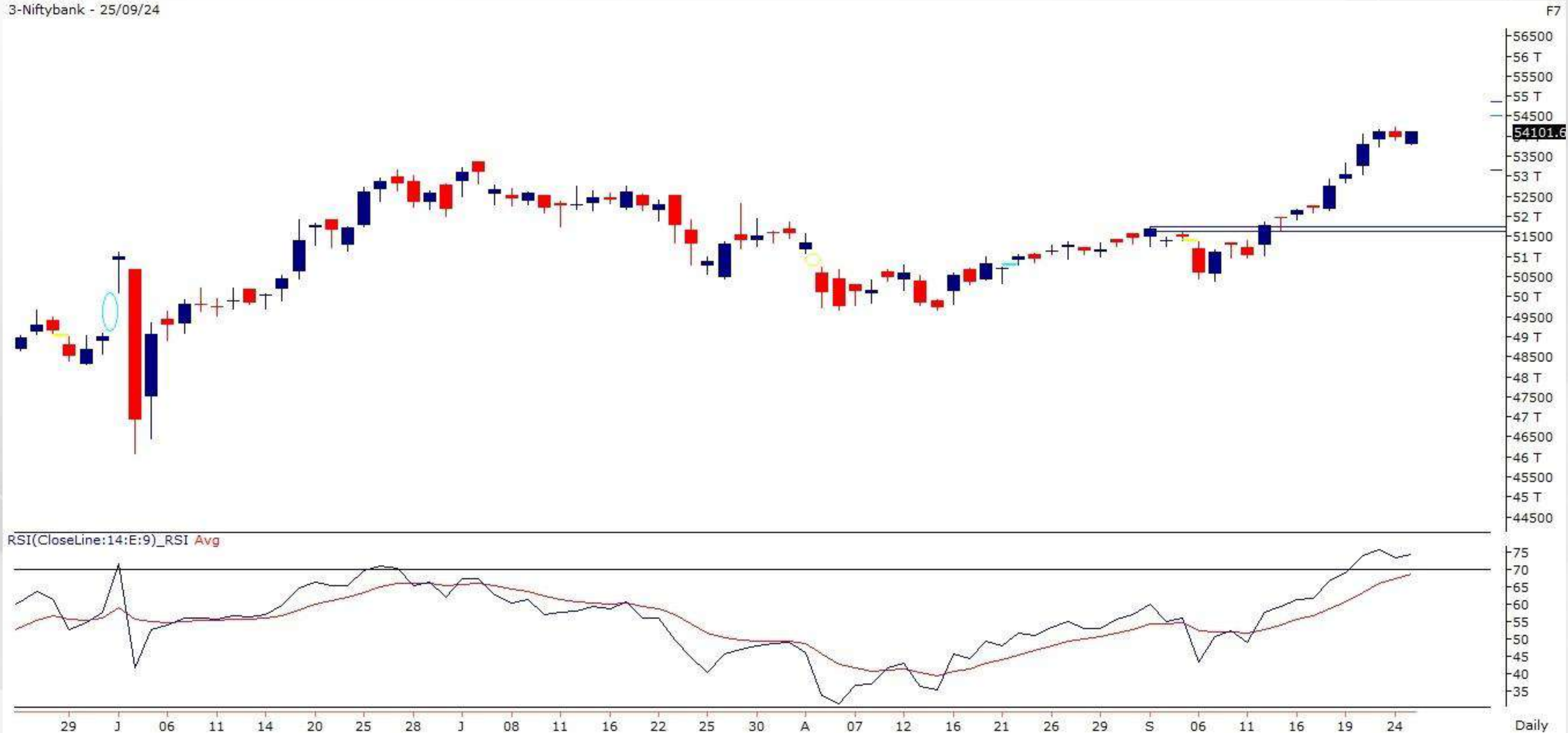
3-Niftybank - 25/09/24

BANK NIFTY (CMP : 54101) Bank Nifty support is at 53750 then 53500 zones while resistance at 54247 then 54750 zones. Now it has to hold above 53750 zones for an up move towards 54247 then 54750 zones while on the downside support shifts higher to 53750 then 53500 levels.