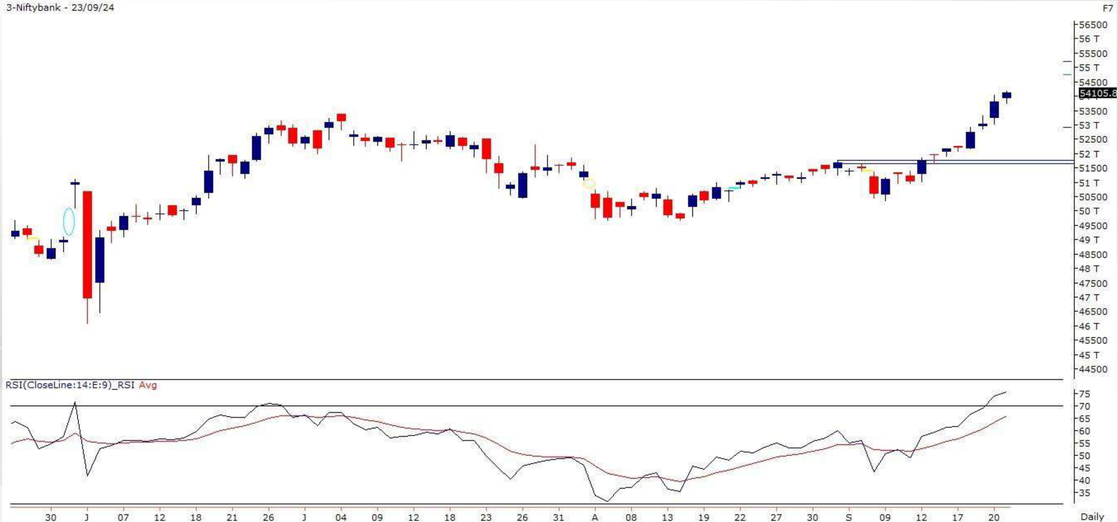
3-Niftybank - 23/09/24

BANK NIFTY (CMP : 54105) Bank Nifty support is at 53750 then 53500 zones while resistance at 54500 then 55000 zones. Now it has to hold above 53750 zones for an up move towards 54500 then 55000 zones while on the downside support shifts higher to 53750 then 53500 levels.